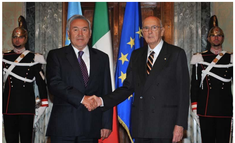
Kazakhstan’s President Nursultan Nazarbayev (L) shakes hands with Italian President Giorgio Napolitano after talks held in Rome.

Presidents Nazarbayev and Napolitano discussed a wide range of cooperation issues between the two countries, identified prospects of positive interaction in political, economic, and humanitarian fields. The two presidents noted their close positions on most international problems including nuclear non-proliferation and disarmament, Middle East settlement, and the stabilization of Afghanistan. The Italian President highlighted the